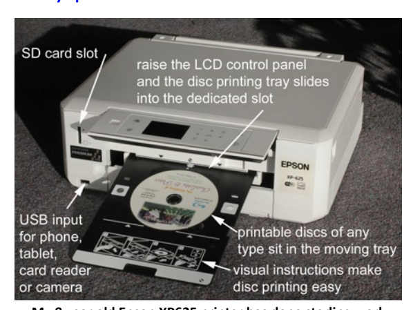
My 8 year old Epson XP625 printer has done sterling work and has been incredibly reliable, versatile and useful

I've had my £90 Epson XP625 for nearly eight years now. I bought this particular model because I was doing a lot of disc printing back then, and being an Epson, compatible ink manufacturers were falling over themselves to be Amazon's lowest price seller. While the manufacturer's guarantee was in force I bought genuine Epson ink, but with the machine's thirst and five individual inks to buy at something like £13.50 for each cartridge, I soon shifted to feeding it compatibles. Subsequently the printer's little display screen would constantly warn me of the dire consequences of using non-genuine inks, but I went ahead anyway. At 53p per cartridge delivered, from e-Bay, what had I got to lose?