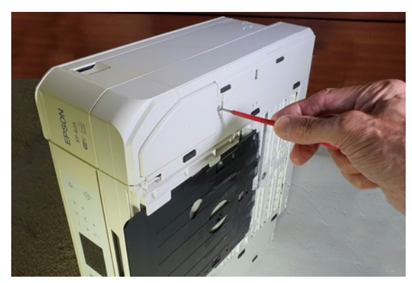
The instructions that come with your new ink absorption pads explain exactly how to dismantle the printer, and it's a pretty simple job

I decided that I wanted to keep my printer away from landfill, and do a complete clean and reset myself. I contacted a firm called Octolnkjet who were most helpful, putting me in touch with PrinterPotty (www.printerpotty.com). I paid a grand total of £16.95, told them my printer model and PC's operating system (Windows 10) and through the post came a fat envelope that contained all the new waste ink printer pads, the Reset Key code and crucially, excellently illustrated take-you-by-the-hand instructions .