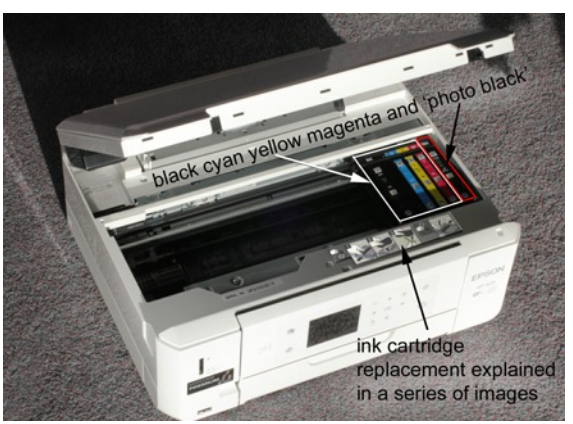
I've used 25 times cheaper compatible ink cartridges in my Epson for years, with no ill effects whatsoever

And the printer has been just fine thanks, all of these years. The longevity of my prints may not be up to those made using genuine inks, but ho-hum, they look good to me.