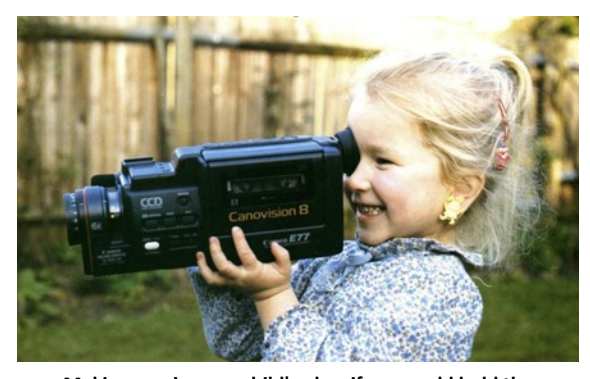
Making movies was child's play, if you could hold the camera!

The arrival of the video camera, first as a two-piece unit, camera and tape recorder, then as a single unit CAMera-reCORDER, camcorder, did not significantly change the structure of the amateur movie. Appearance wise there was a major difference, as video editing involved re-recording the camera footage to a VCR. The result was often fuzzy or soft images and colours that bled. The soundtrack was no better in quality than that from stripe, as initially only a linear edge track was available to record sound.