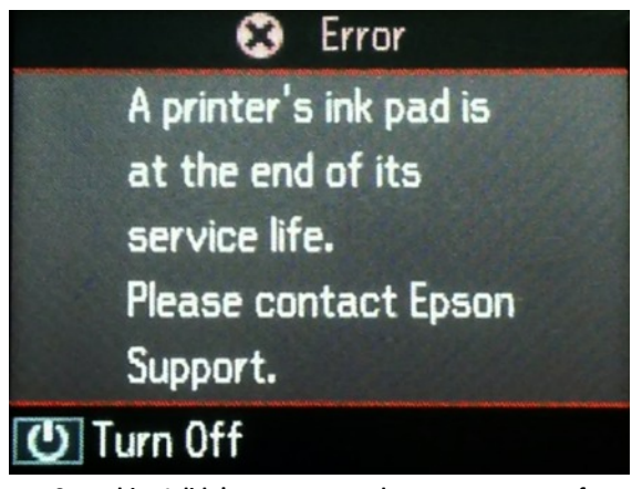
Something I didn't want to see - the announcement of death appeared on the printer's LCD screen

I really can't complain considering the work this printer has done for me over the years, but one day last month a warning flashed up on the printer's screen telling me the printer was nearing the end of its service life and I'd have to contact Epson support. I ignored it, as one does, until a week or so later the printer came to an abrupt halt, displaying the screen of death, and I found there was nothing I could do to revive it.