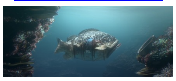
Making of Hybrids https://www.youtube.com/watch?v=vK4-OGNhrjl

Hybrids Short Film - amazing animation https://www.youtube.com/watch?v=acnWy-tl3ng