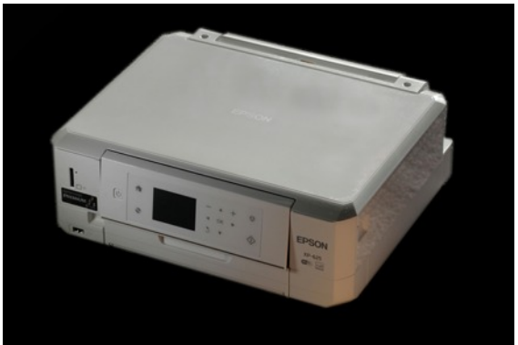
The Epson XP625 printer is a very versatile all-in-one photo and disc printer from 2014

Maybe, you don't need to throw it out and buy another!