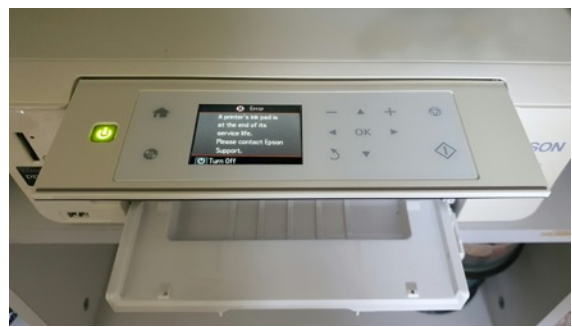
It looks really ominous, but in reality you'll be up and running again in no time

Google really is your friend, and I found I wasn't alone in this, and it was a fairly common occurrence to be shown this message with printers that have worked hard.