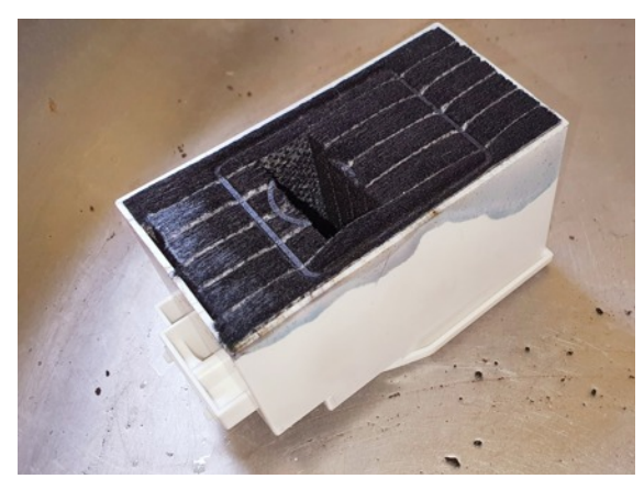
On removal from my Epson my ink reservoir looked like this. The absorbent pads were completely saturated with waste ink and needed changing. The supplied replacements fitted perfectly

These instructions contained no less than 21 colour photographs, showing you exactly which screws needed to come out, in which order, to access and remove the waste ink pad holder from the bottom of your particular printer. Further instructions (15 colour photos) explained how to remove the old ink saturated pads and replace them with the new ones.