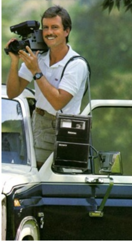
Camera and separate tape recorder

The arrival of the video camera, first as a two-piece unit, camera and tape recorder, then as a single unit CAMera-reCORDER, camcorder, did not significantly change the structure of the amateur movie. Appearance wise there was a major difference, as video editing involved re-recording the camera footage to a VCR. The result was often fuzzy or soft images and colours that bled. The soundtrack was no better in quality than that from stripe, as initially only a linear edge track was available to record sound.